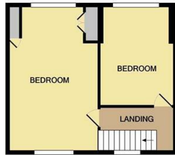
1ST FLOOR APPROX. FLOOR AREA 304 SQ.FT. (28.3 SQ.M.)