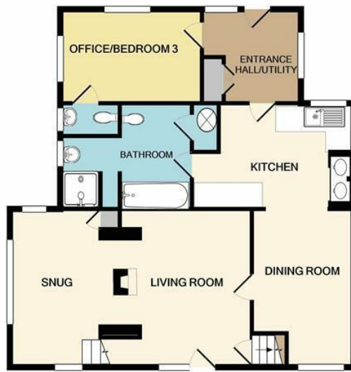
GROUND FLOOR APPROX. FLOOR AREA 655 SQ.FT. (60.8 SQ.M.)