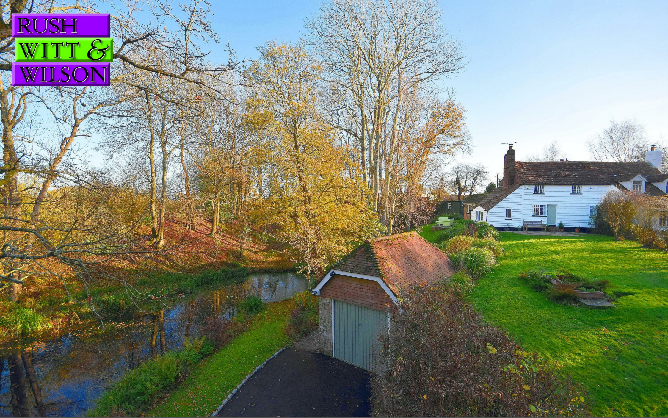
Martinshaw Cottage, Lordine Lane, Ewhurst Green, East Sussex, TN32 5TR. £575,000 Freehold